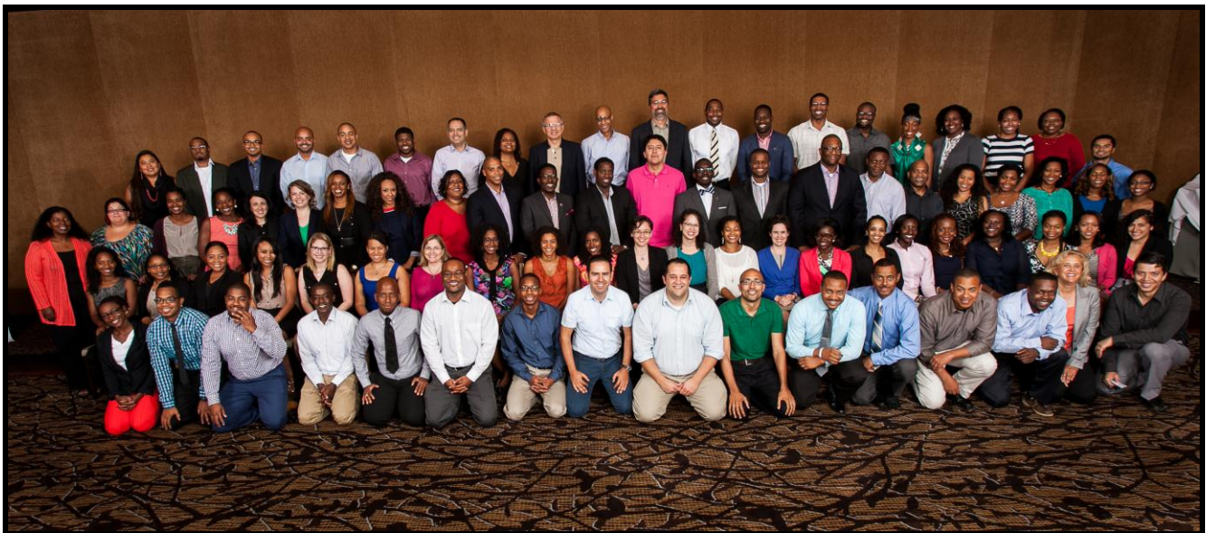
PhD Project Members at the 2014 Management DSA Conference in Philadelphia

The Academy of Management's Annual Meeting is in Vancouver, BC this year from Friday, August 7th through Tuesday, August 15th. The Doctoral Student Association Conference will precede it starting Wednesday, August 5 th .